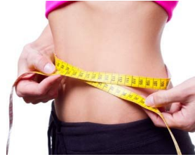
5 Steps to a flat tummy in 7 days