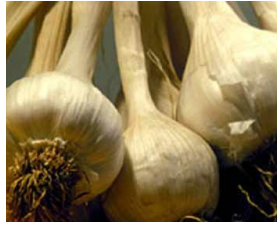
12 Indian foods that cut fat