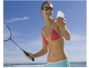
10 Tips for guaranteed weight loss